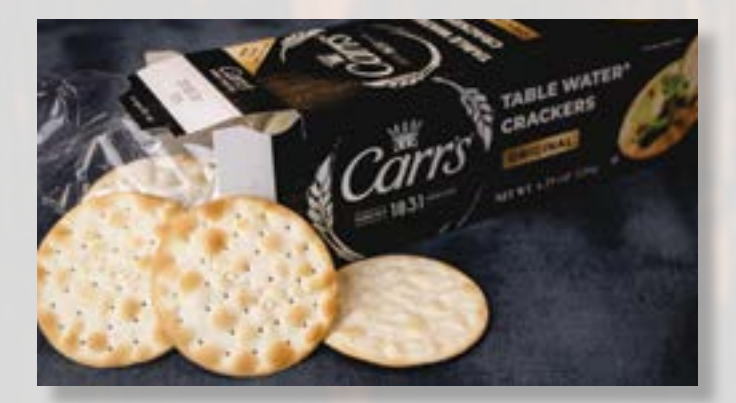
TABLE WATER CRACKERS Royal banquet pack

These new and improved crackers deliver a hearty cracker profile, toasted color, and great taste in a contemporary new design.